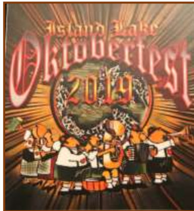
2019 Winning Logo