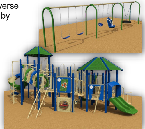
Converse Park Playground

Veterans Park We have completed our shoreline restoration. We also added a kayak launch— thanks in part to a generous donation from the Lions Club. Please make sure to check it out.